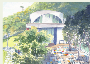
突破八景 3 - 教堂旁的友人 Portraits of Breakthrough 3 - Friends by the Chapel