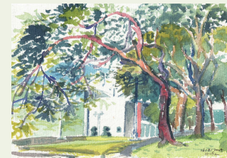
突破八景 6 - 十架 Portraits of Breakthrough 6 - The Cross