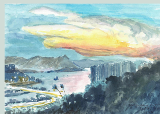
突破八景 1 - 闖進來的晚霞 Portraits of Breakthrough 1 - Breakthrough at Dusk