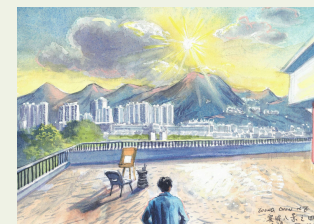
突破八景 4 - 夕陽之約 Portraits of Breakthrough 4 - A Date with Sunset