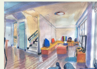
突破八景 7 - 靜謐的空間 Portraits of Breakthrough 7 - Space between Thoughts

*突破八景第1至第7景 Portraits of Breakthrough 1 - 7 Limited Print (ed. 30), 30x22cm (paper size 38x29cm), 293gsm Acid-Free Fine Art White Paper