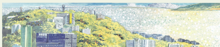
突破八景 8 - 請記住每天總有浪漫 Portraits of Breakthrough 8 - Unfolding Romance in Everyday Life

*突破八景第1至第7景 Portraits of Breakthrough 1 - 7 Limited Print (ed. 30), 30x22cm (paper size 38x29cm), 293gsm Acid-Free Fine Art White Paper