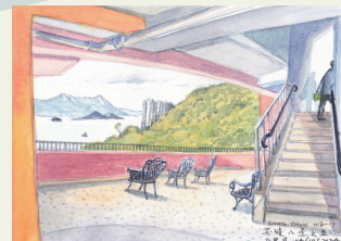
突破八景 5 - 千里目 Portraits of Breakthrough 5 - Distant Look